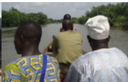
peaceful boat ride to the village