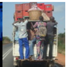
traveling cheap !