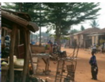
Street view in Klouékanmé