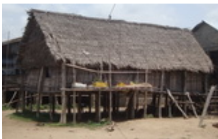
One of the houses on the lake