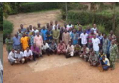
The men at the Grace conference